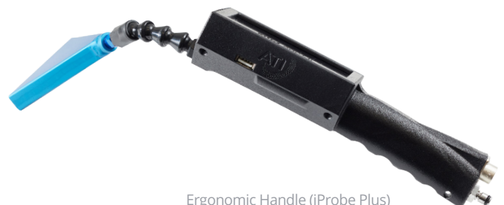
Ergonomic Handle (iProbe Plus)