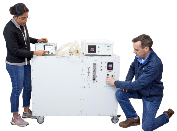
ATI's CALIBRA™ system for photometer calibration